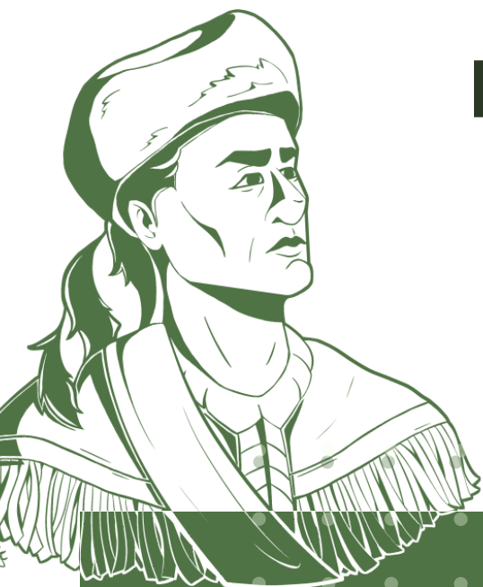
"The Pioneer", Wisdom's School Mascot.

Say "yes" approach gets ACAP a solid partnership with MSAD #33 school.